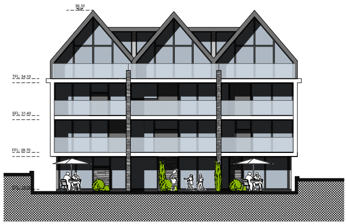
FRONT SOUTH EAST ELEVATION SCALE 1:100