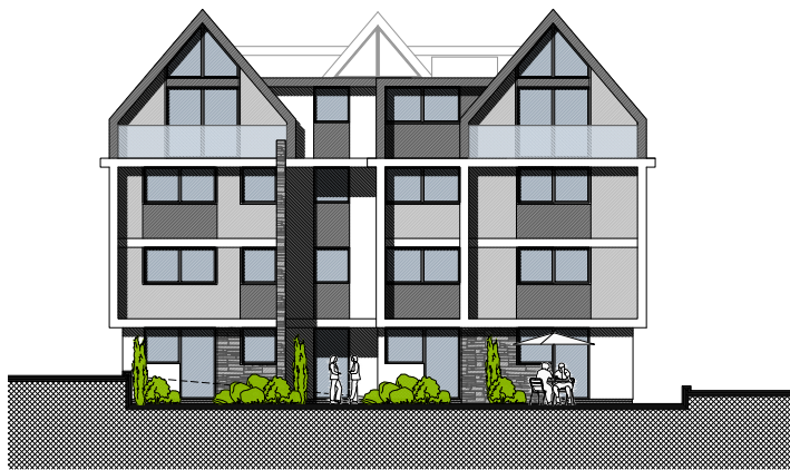
REAR NORTH WEST ELEVATION SCALE 1:100